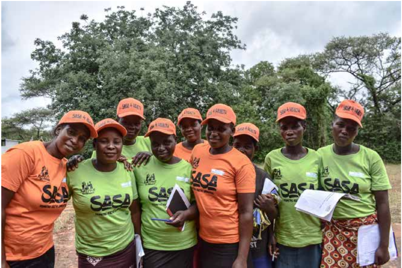
Peer educators in Mbire(Angwa)